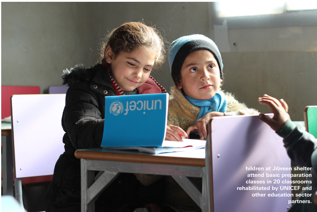
Children at Jibreen shelter attend basic preparation classes in 20 classrooms rehabilitated by UNICEF and other education sector partners.