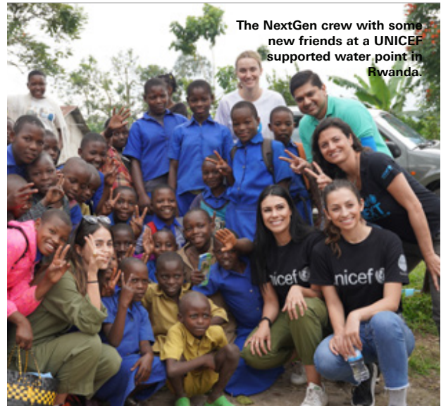
The NextGen crew with some new friends at a UNICEF supported water point in Rwanda.

Here, we met the local radio show duo that was delivering UNICEF programming over the loudspeakers – in the form