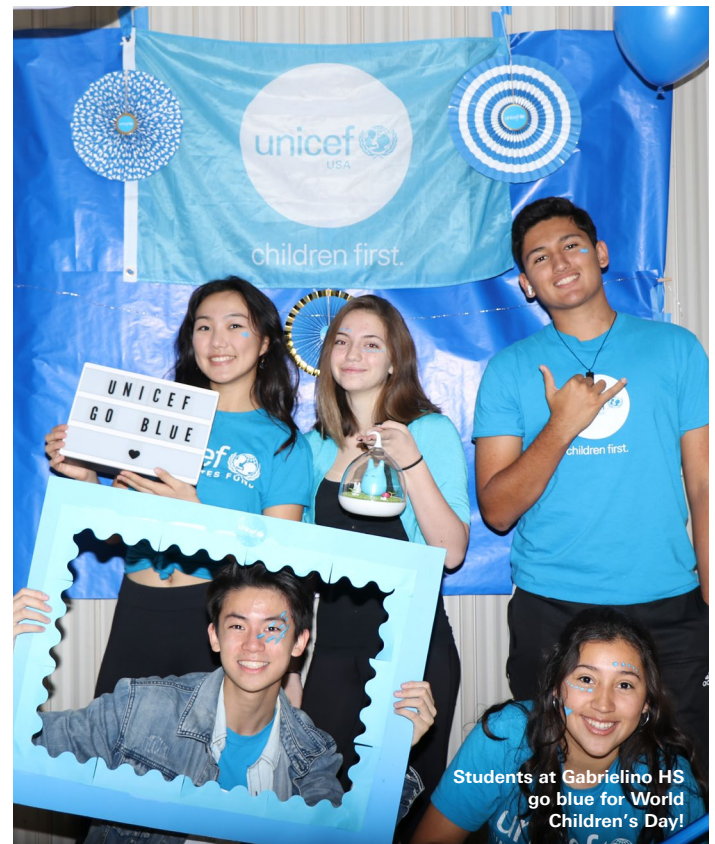
Students at Gabrielino HS go blue for World Children's Day!

See our Policies one pager to make sure you are aligned with UNICEF USA's values.