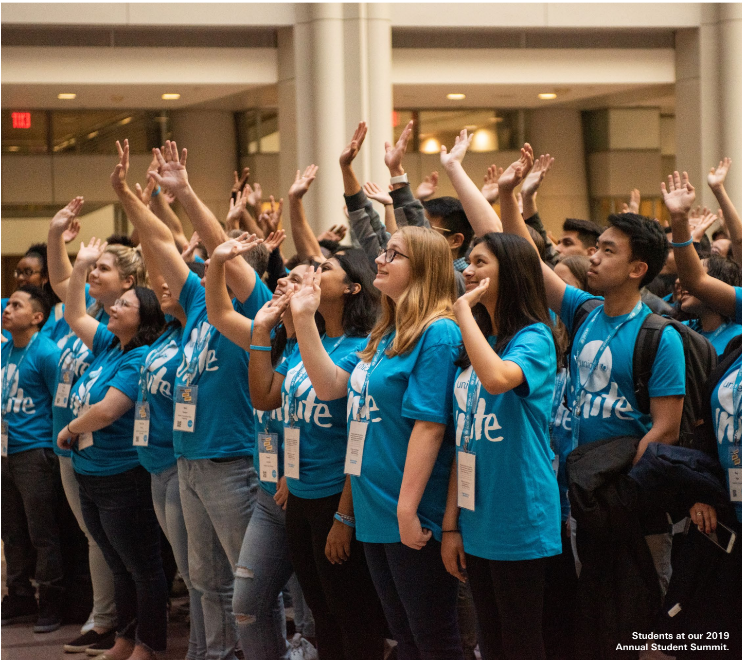
Students at our 2019 Annual Student Summit.

Everything You Need to Know to Start a UNICEF Club at Your School