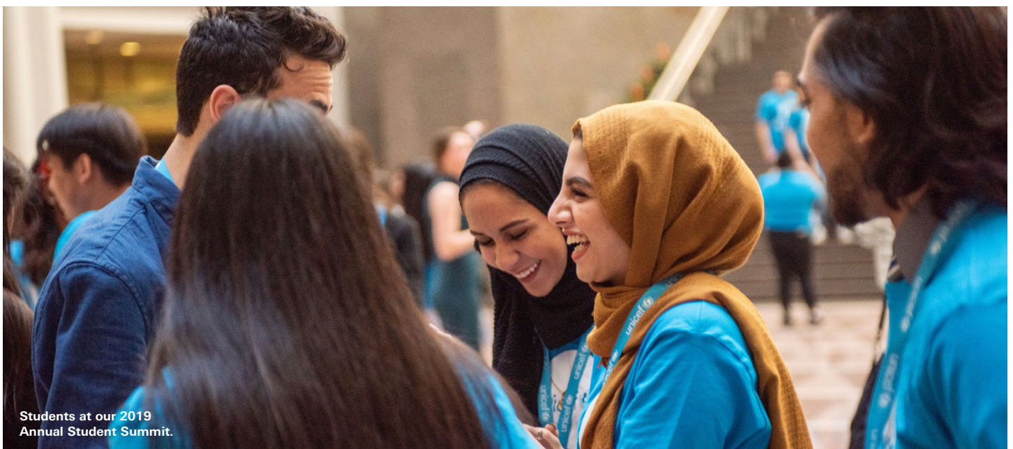
Students at our 2019 Annual Student Summit.

You and your advisor are never alone, reach out to our team for questions or help at volunteer@unicefusa.org .