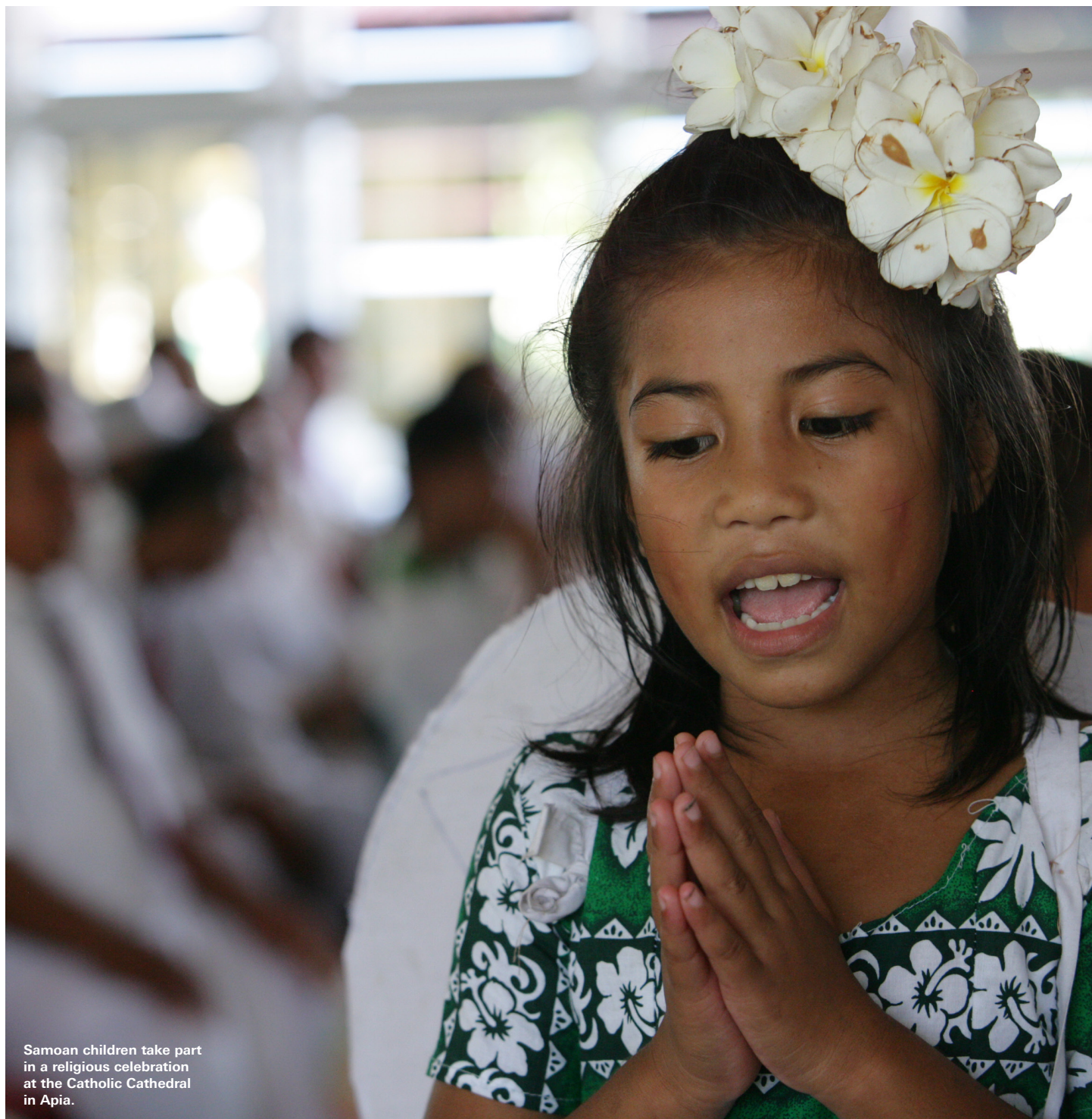
Samoan children take part in a religious celebration at the Catholic Cathedral in Apia.

have extensive networks with access to the most disenfranchised and vulnerable groups, such as those living as refugees and migrants. With this in mind, we recognize that faith communities are effective, powerful advocates to prevent, address and end child trafficking and other global issues affecting children. We hope this toolkit provides relevant guidance for faith communities with replicable ideas and examples of how faith actors can take collective action to end trafficking. We look forward to witnessing the progress that individuals, united and motivated by interfaith values, are able to achieve on behalf of the world's children. ●