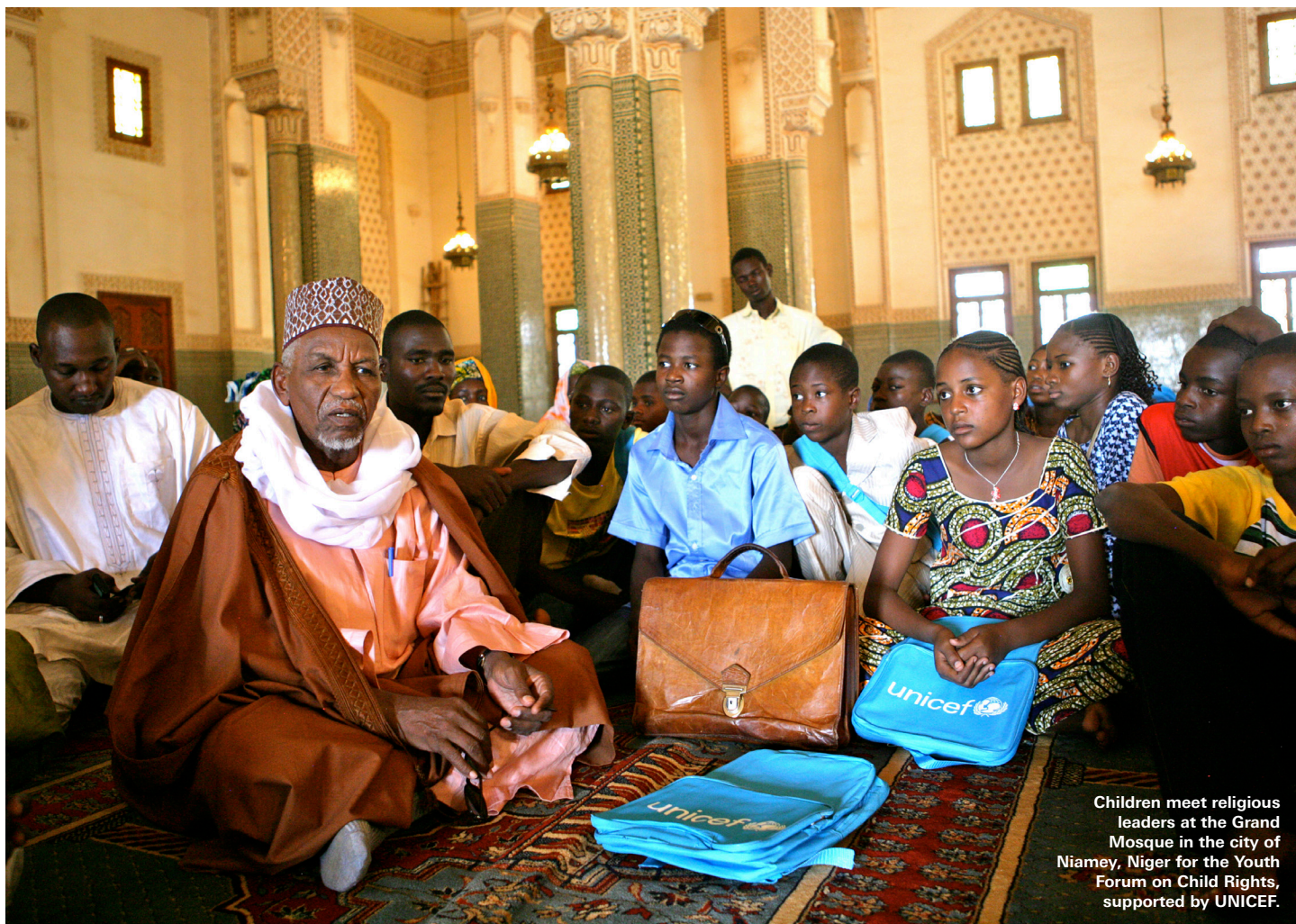
Children meet religious leaders at the Grand Mosque in the city of Niamey, Niger for the Youth Forum on Child Rights, supported by UNICEF.

Jewish tradition is rooted in the concepts of tzedakah and chesed . These overarching values of generosity and compassion form the foundation of Jewish teachings on social justice, while the remembered journey to freedom from slavery helps establish the foundation of Jewish empathy for the most vulnerable. The Torah instructs Jews to "protect the stranger" and end oppression, while the rabbis of the Talmud emphasize that redeeming captives is one of God's greatest commandments, as they