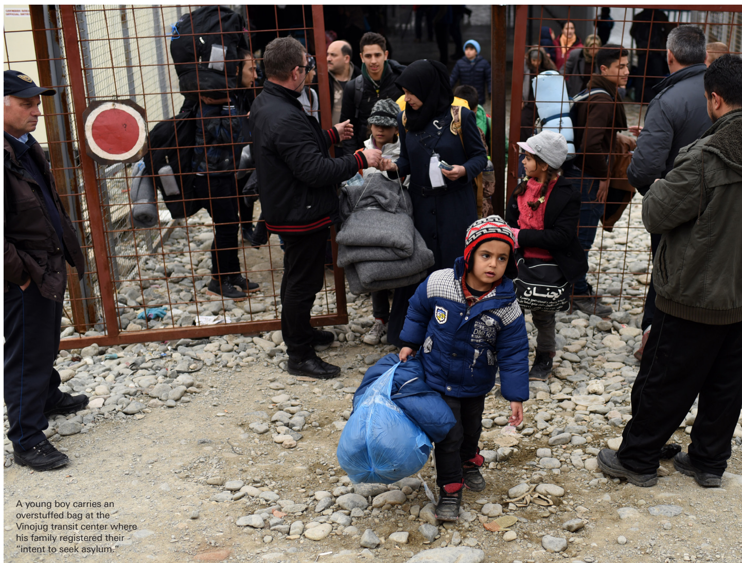
A young boy carries an overstuffed bag at the Vojvodina transit center where his family registered their “intent to seek asylum.”

– Anthony Lake, Executive Director, UNICEF