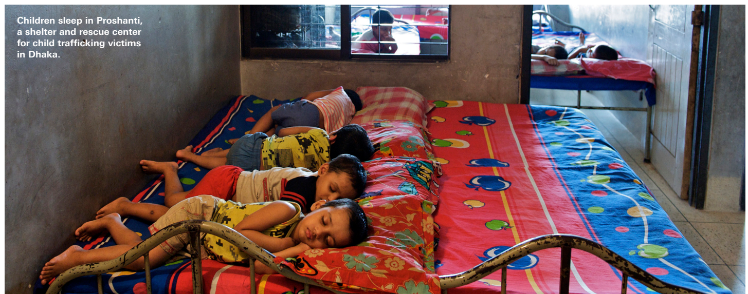
Children sleep in Proshanti, a shelter and rescue center for child trafficking victims in Dhaka.

2 A "child" is considered any person under the age of 18.