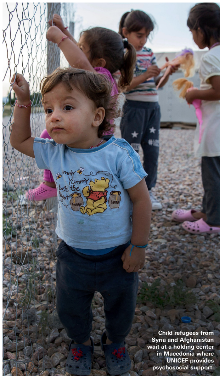
Child refugees from Syria and Afghanistan wait at a holding center in Macedonia where UNICEF provides psychosocial support.

Unitarian Universalism Included within the core Principles of Unitarian Universalism are the promise of "justice, equity and compassion in human relations" (4th Principle) as well as "the goal of world community with peace, liberty and justice for all" (6th Principle). Both of these urge openness and welcoming to all, especially those who are suffering or in need of sanctuary.