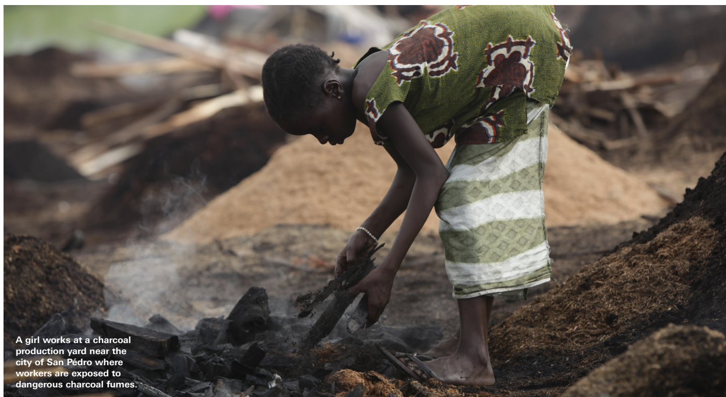
A girl works at a charcoal production yard near the city of San Pedro where workers are exposed to dangerous charcoal fumes.

– UU United Nations Office 2007 Intergenerational Seminar Statement