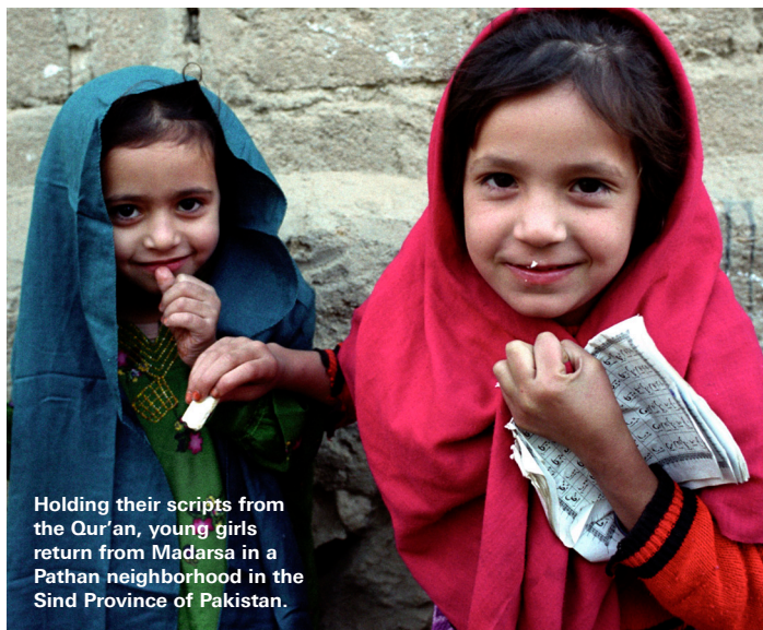
Holding their scripts from the Qur'an, young girls return from Madarsa in a Pathan neighborhood in the Sind Province of Pakistan.