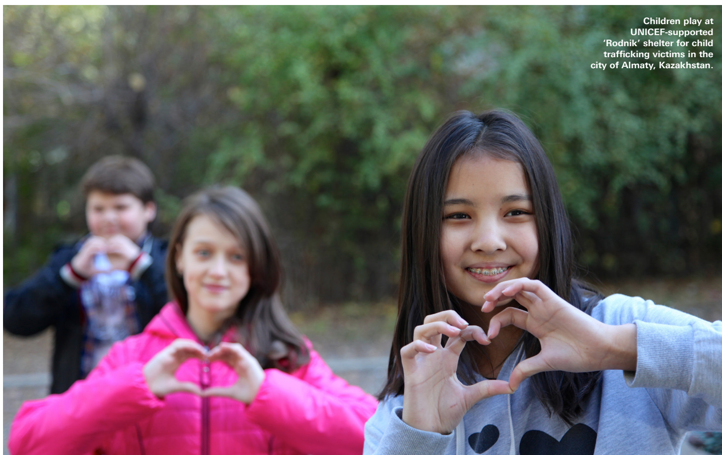
Children play at UNICEF-supported 'Rodnik' shelter for child trafficking victims in the city of Almaty, Kazakhstan.

The faith values highlighted in this toolkit are based on the understanding, interpretation, and guidance of our interfaith partners and do not necessarily encompass the full breadth of views within each major religious tradition. In addition, while UNICEF works very closely with religious communities around the globe, the faith values in this toolkit do not represent the views of UNICEF or UNICEF USA.