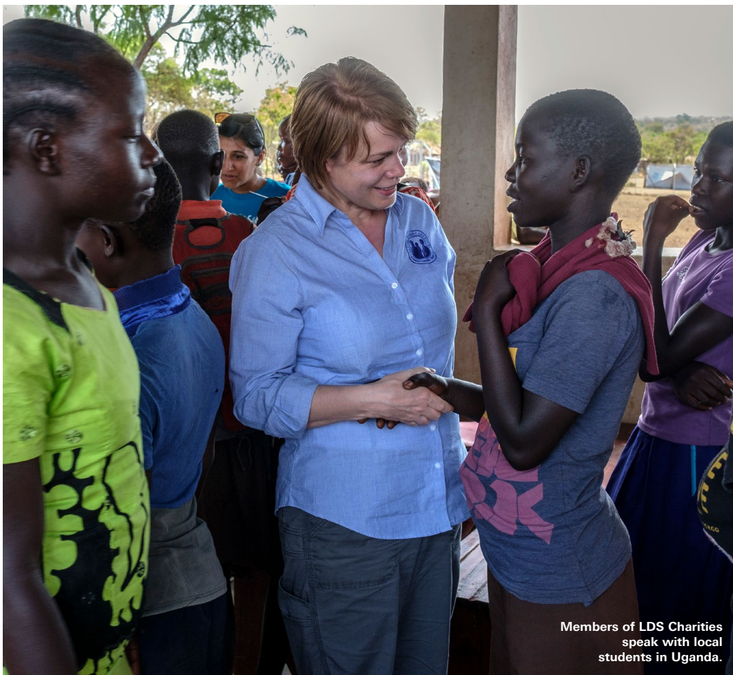
Members of LDS Charities speak with local students in Uganda.