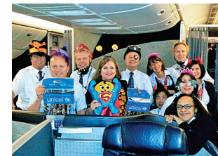
The entire crew of flight No. 234 from GRU-MIA on October 28th in the Trick-or-Treat for UNICEF spirit.

Thank you for participating. We hope you had fun!