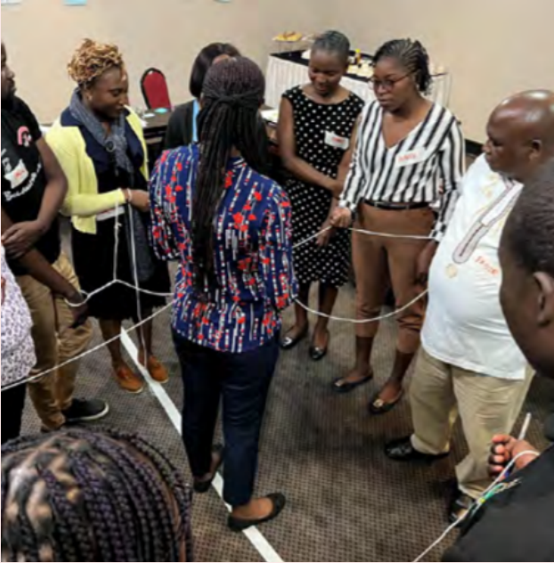
Participants at a GTA Tool workshop in Zambia

The Gender Transformative Accelerator Tool (also known as GTA Tool) workshop is designed as a process of rapid programmatic review that brings together staff, government representatives, CSOs and other implementing partners. Originally launched in 2021 during Phase II, a second edition of the facilitator guide was released in April 2024 34 . The vision of the workshop has now been revised to integrate values clarification exercises 35 addressing the internal gender biases of staff and implementing partners. The process starts with a priority-setting conversation; it is then followed by an immersive in-person workshop over three to five days that focuses on the core elements of a gender-transformative approach and reflection on personal and organizational values. The workshop reviews key concepts around gender through an iterative process that helps participants to analyse their work. The main intended outcome is that staff and partners co-create a prioritized road map that helps them identify a set of actions needed to integrate gender-transformative approaches into their work that align with the Global Programme's contextualized ToC.