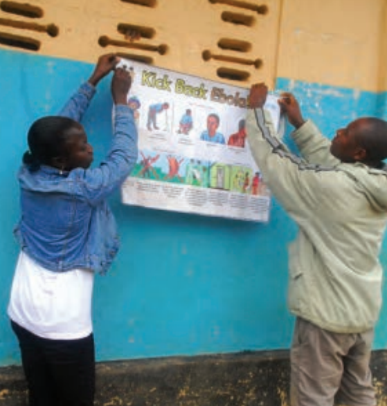
UNICEF helped India eradicate polio, a major milestone in global public health; community mobilizers post vital information about Ebola in West Africa.