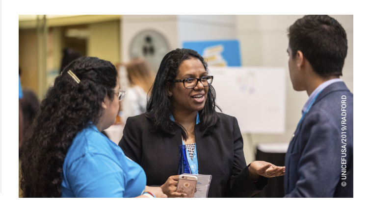
Tips & Tricks: Partnerships are about building relationships. Dedicate time and energy to them!