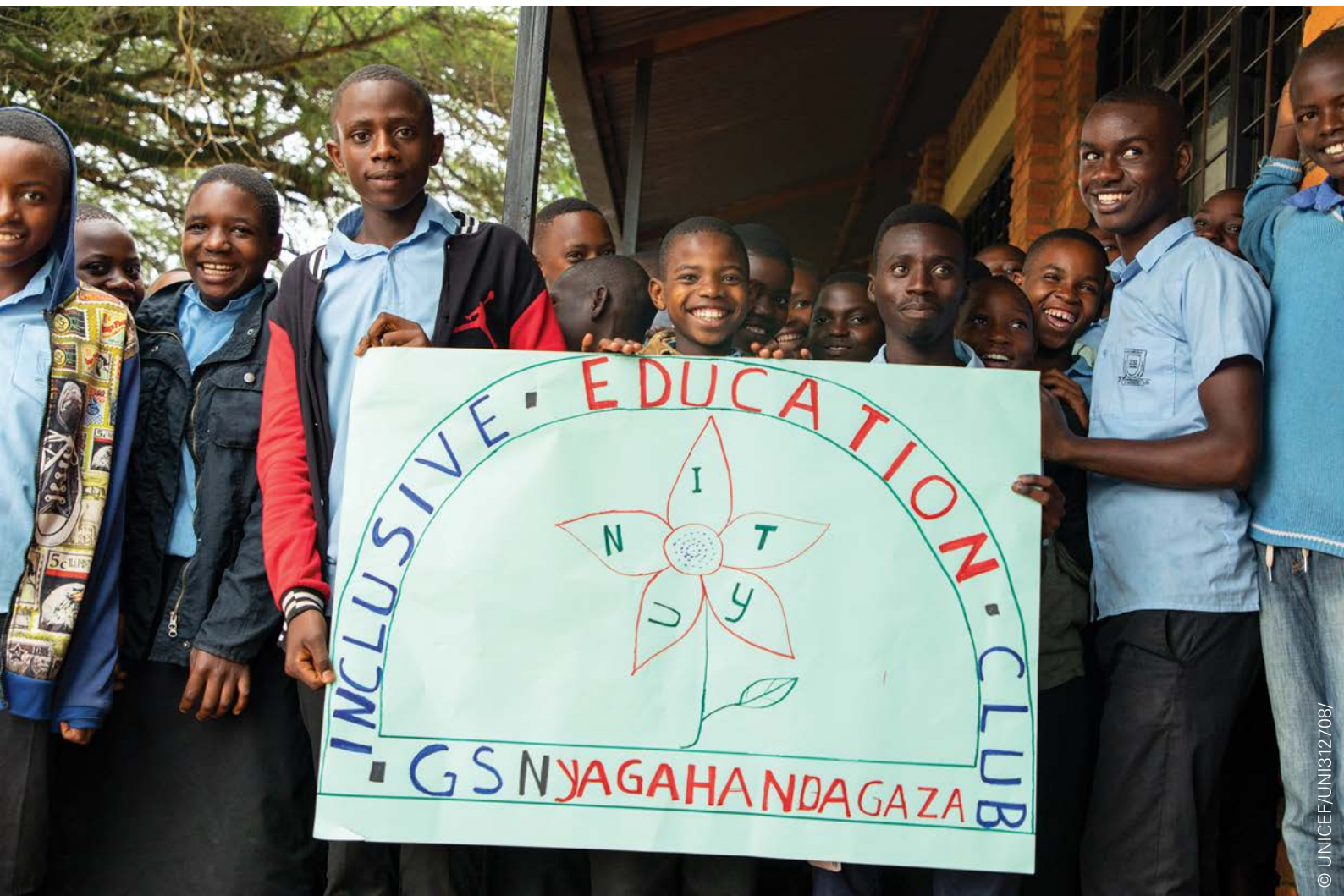
Students at G.S. Nyagahandagaza, learn under the UNICEF-supported inclusive education programme, where children with disabilities sit integrated in normal classrooms.

The impact on families from the direct costs of disability is also highly significant. As these costs are usually not considered in determining poverty lines, the true poverty rate of families with members with disabilities (adjusting for these costs) is probably higher. In addition, children with disabilities may sometimes get less than their share of family resources, further affecting their well-being. The poverty gap is even larger when multidimensional aspects of poverty are considered, like