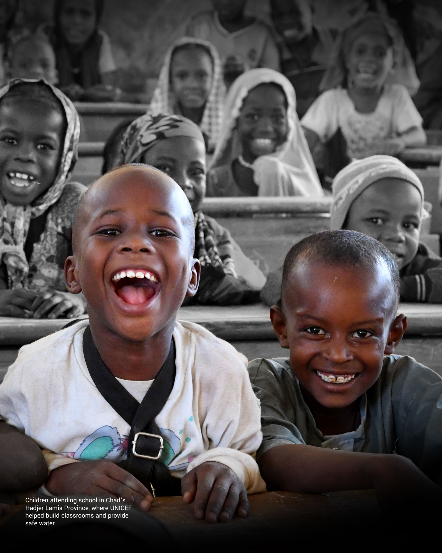
Children attending school in Chad's Hadjer-Lamis Province, where UNICEF helped build classrooms and provide safe water.