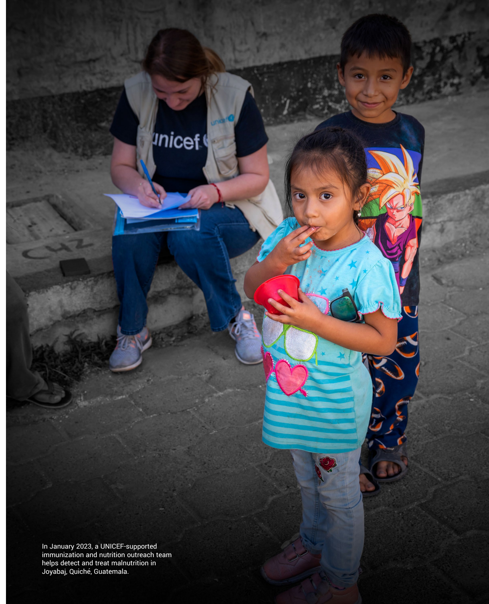
In January 2023, a UNICEF-supported immunization and nutrition outreach team helps detect and treat malnutrition in Joyabaj, Quiché, Guatemala.