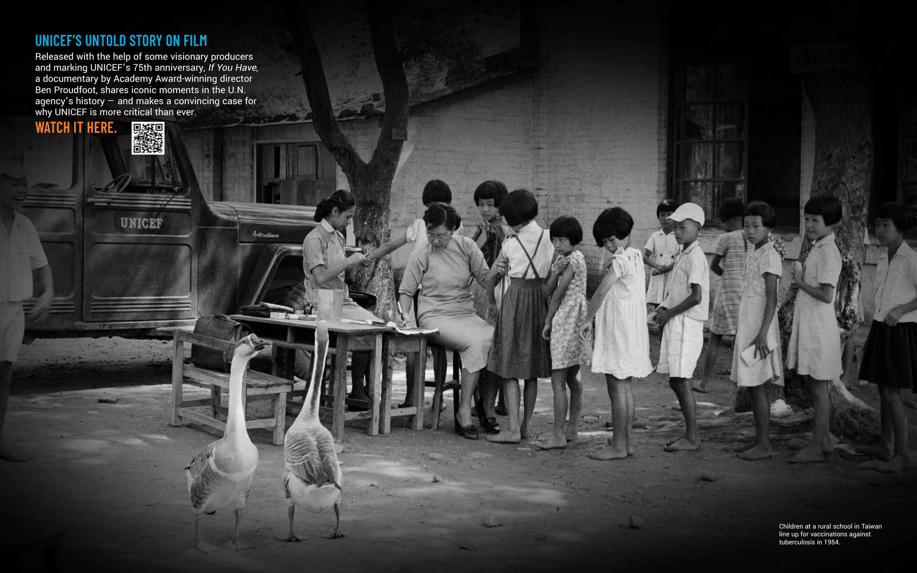
Children at a rural school in Taiwan line up for vaccinations against tuberculosis in 1954.