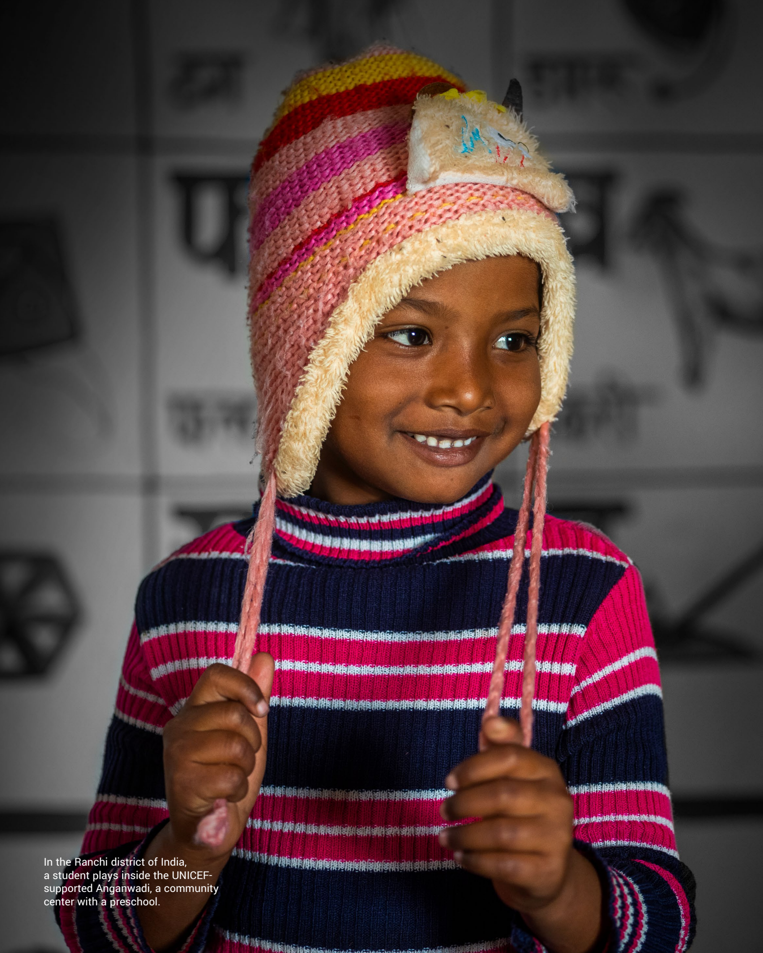
In the Ranchi district of India, a student plays inside the UNICEF-supported Anganwadi, a community center with a preschool.